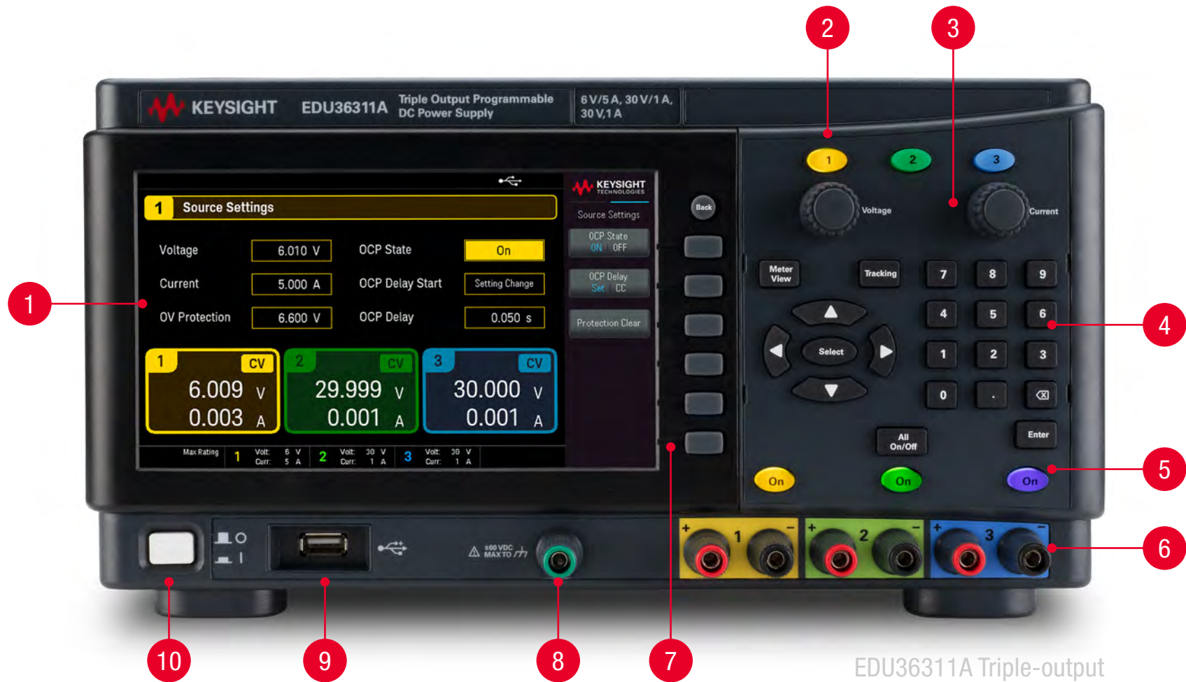
EDU36311A Triple-output Programmable DC Power Supply