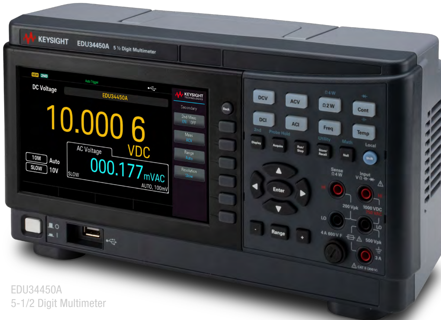
EDU34450A 5-1/2 Digit Multimeter