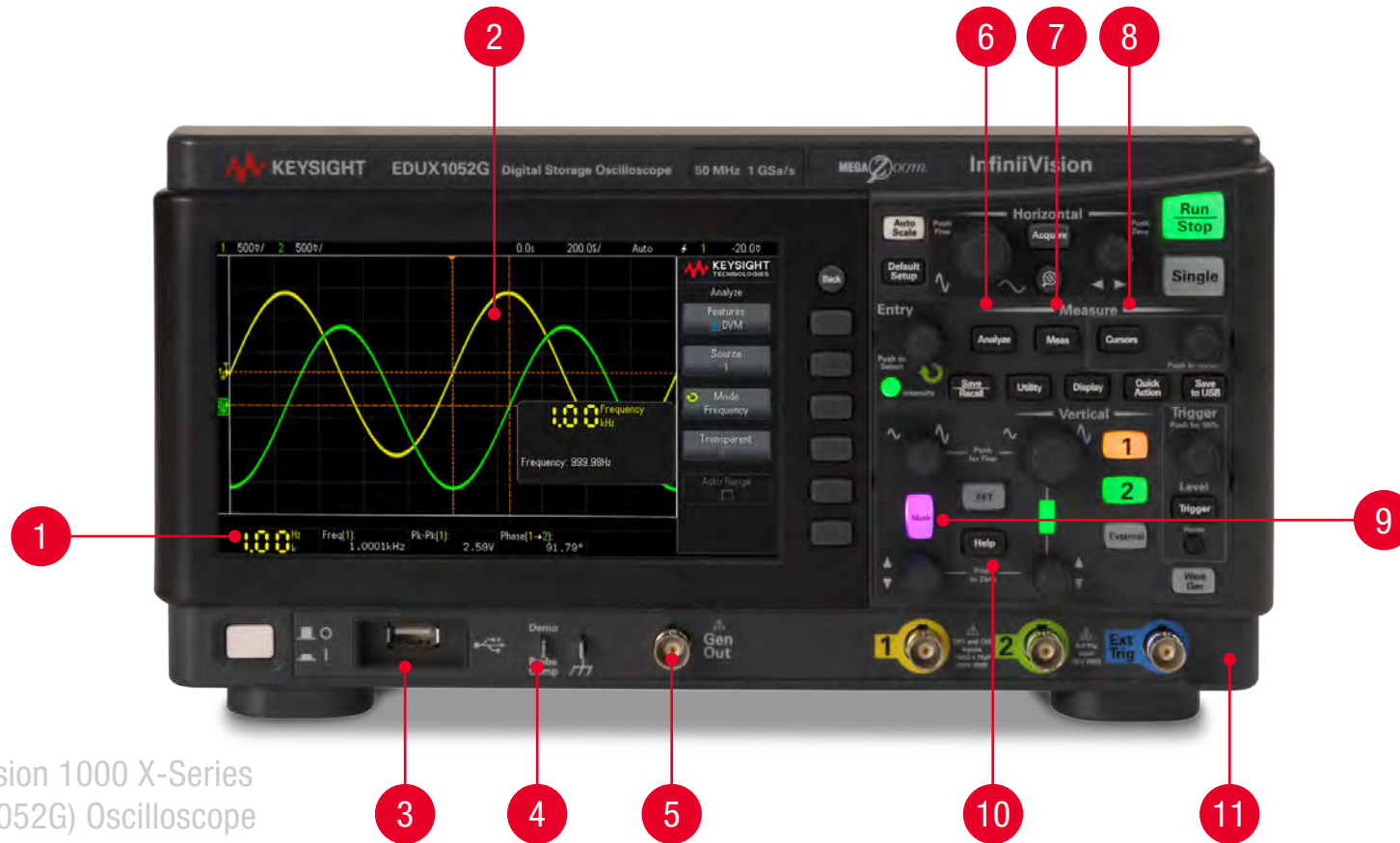
InfiniiVision 1000 X-Series (EDUX1052G) Oscilloscope